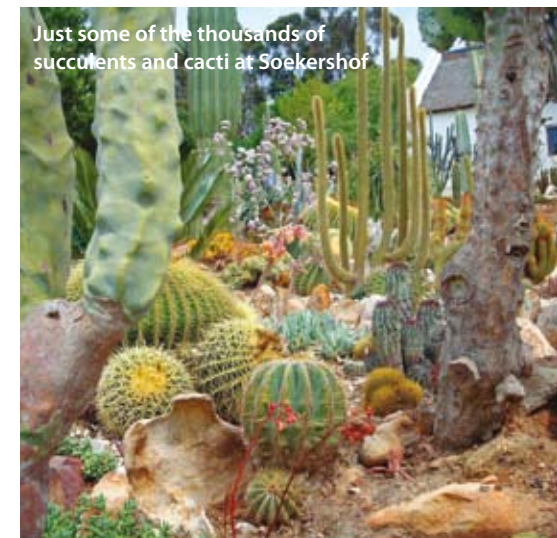
Just some of the thousands of succulents and cacti at Soekershof